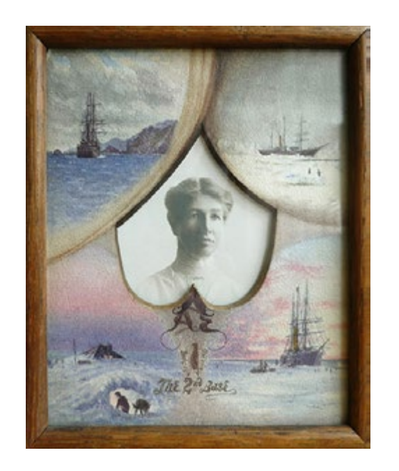
Charles Turnbull Harrisson Montage 13 x 10cm created in Antarctica 1912, collection Geoffrey Harrisson